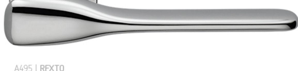
A495 | RFXTO