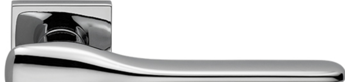
A495 | RFXQO