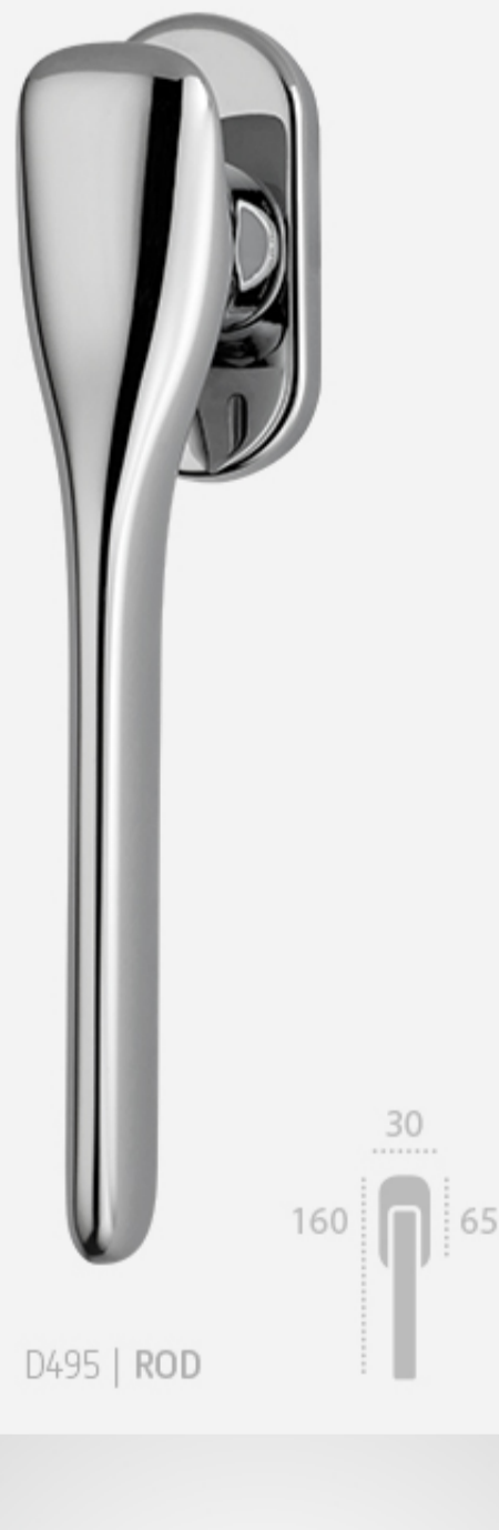
D495 | ROD