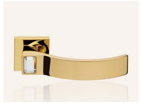
OZ oro zecchino gold plated