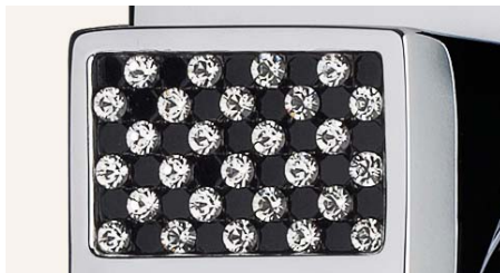
1348 swarovski black cristallo black crystal swarovski