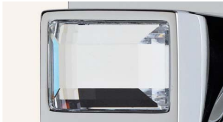
1340 swarovski cristallo crystal swarovski