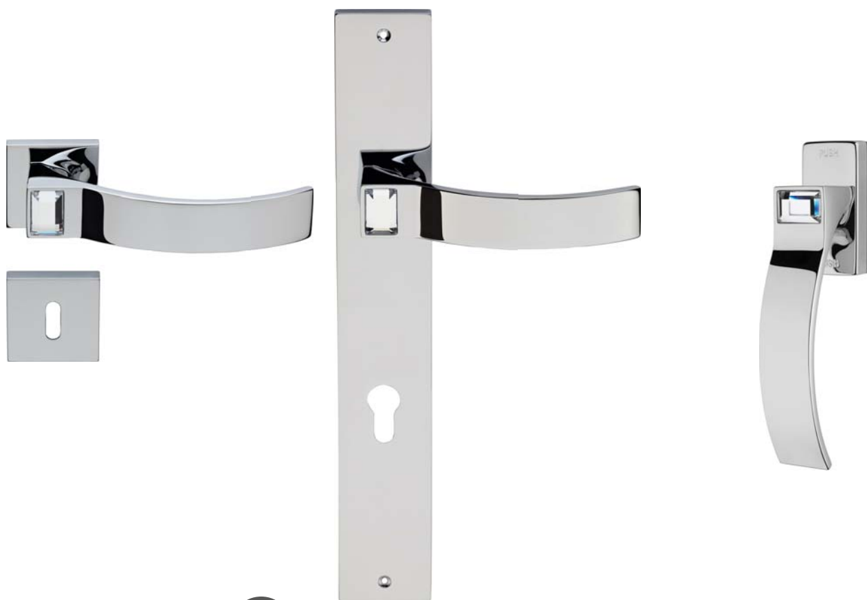
COD. 1340 RB 019