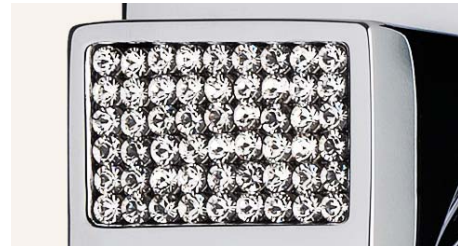
1344 swarovski mesh cristallo mesh crystal swarovski