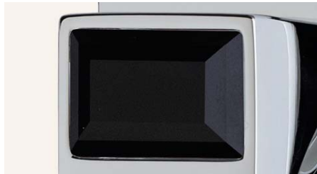
1343 swarovski jet nero black jet swarovski